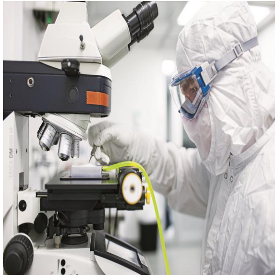
Scientific & Technical Expertise