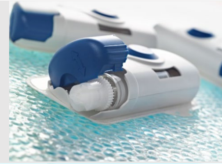
SmartDose ® On-Body Delivery System