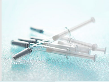
Daikyo ® Crystal Zenith ® 1 & 2.25mL Insert Needle System